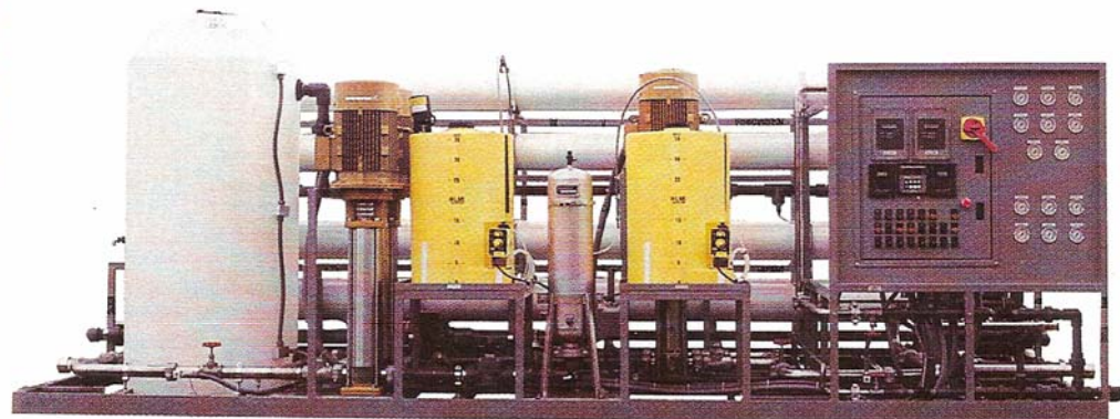
MODEL DELTA-40DP 57,600 GPD of High-Purity Water

US Engineered Products Inc. 300 Old Reading Pike Stowe, PA 19464